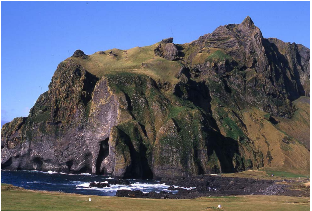
Figure 3. Dalfjall

The active fissures in the Vestmannaeyjar area are generally striking N40°E. Pending on the actual locations of the landfalls of the tunnel on both sides the tunnel would be aligned with an angle to these fissures thus resulting in an unfavourable parallelism rather than a perpendicular intersection. The eruptions in the area, such as the Surtsey and Heimaey eruptions were not one-spot eruptions, these were eruptions along active fissures with length in the range of 3-5km.