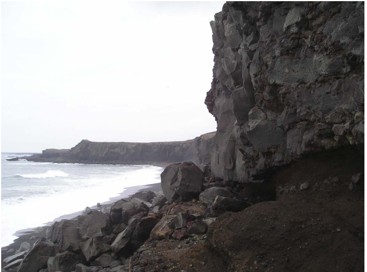
Figure 4. Image from Grindavik

An image from the area close to Grindavik, see Figure 4 below do perhaps illustrate the actual variety and easily eroded, loose rock interbedded with glass hard, jointed basalt.