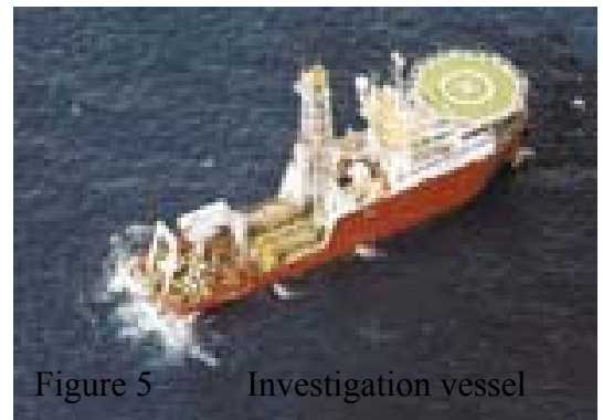
Figure 5 Investigation vessel

Irrespective of what indicative pre-investigations may tell, the above indicated kind of geology with significant local and random variations has to be considered.